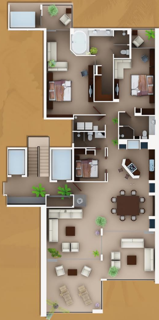
FLOOR PLAN C (Also floor plan E, G and I)