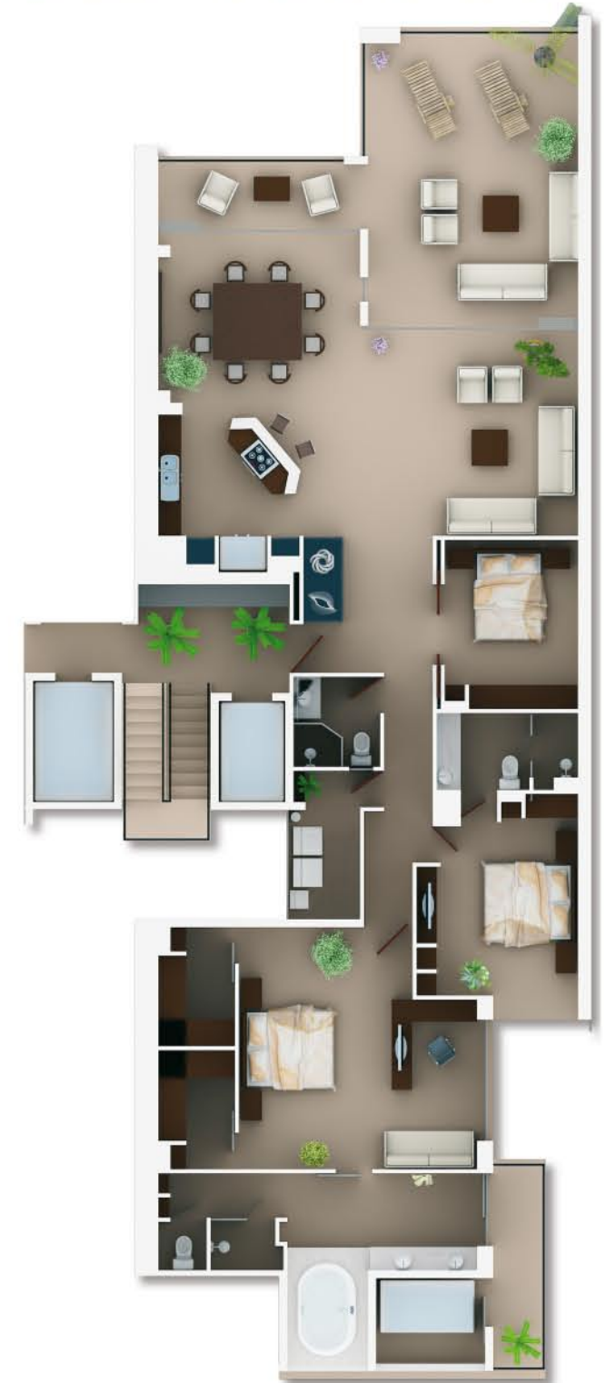
FLOOR PLAN B (Also floor plan D, F and H)