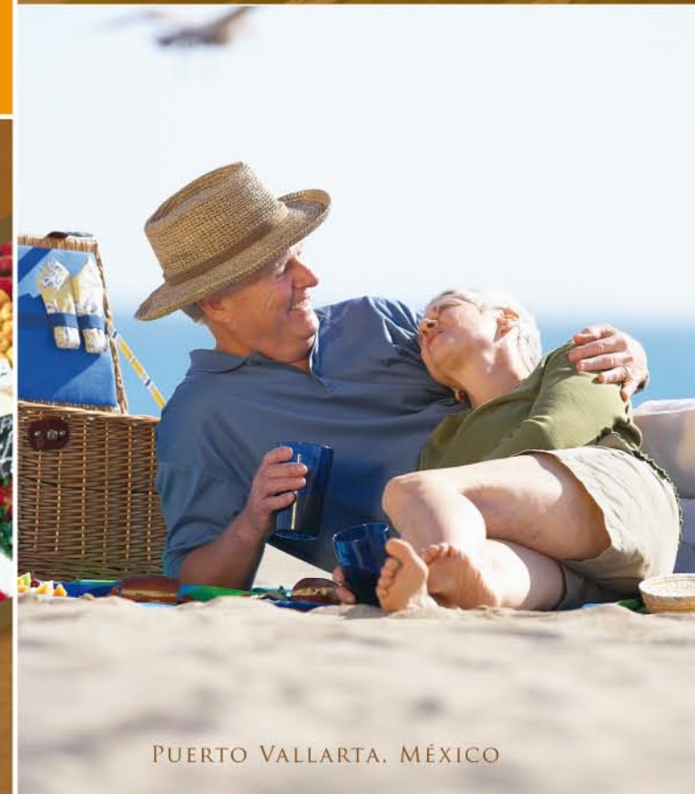
PUERTO VALLARTA, MÉXICO