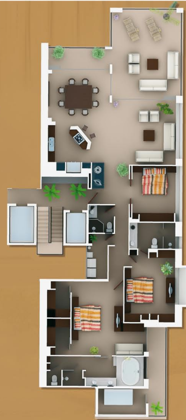
FLOOR PLAN J